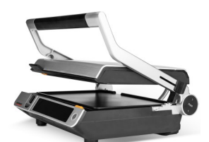
Ribbed upper part grill plate