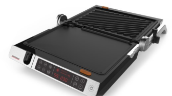
Unfoldable for use as a large barbecue grill