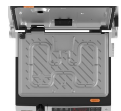
Removable grill griddles- dishwasher proof